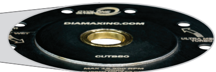
Reinforced center hub